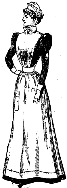
The "Rena" Apron. Made of linen finished Cloth lock-stitch throughout, 2/6 each. In two sizes, 36 in. & 39 in. from waist to hem.