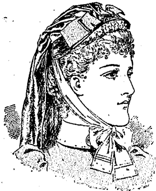
The "St. Bride's" Bonnet. Made of fine Straw with Lace and rucning, and trimmed with Ribbon, and long Silk Gossamer Fall. In black and colours, 12/6 each. Without Fall, 9/6; also The "St. Clare" Bonnet. 6/11 complete.